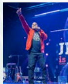
Week 3: July 20, 2024 Shai Linne 7:00pm-Saturday Tickets required