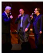
Week 1: July 5, 2024 The Master's Four

Enjoy our summer concert line up, Fridays at 6:30pm in the Chapel (unless noted otherwise below).