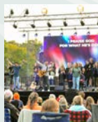
Week 7: August 17, 2024 Worship Under the Stars 7:00pm-Saturday Fellowship Centre Field