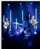
Week 9: August 31, 2024 Worship Project 6:30pm-Saturday