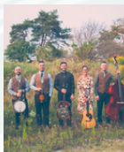
Week 6: August 7, 2026 Rescue Junction