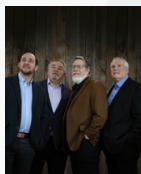
Week 1: July 3, 2026 Torchmen Quartet

Enjoy our summer concert line up, Fridays at 7:00pm in the Chapel (unless noted otherwise below).