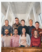
Week 2: July 10, 2026 Emmanuel Song Collective