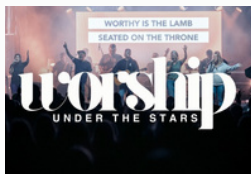
Week 9: August 22, 2026 (Saturday) Worship Under The Stars Fellowship Centre Field

While the concerts are free of charge, we will be collecting a freewill offering to support the music ministry at MBC.