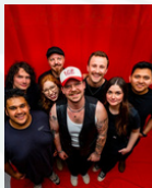
Week 7: August 14, 2026 Backyard Worship